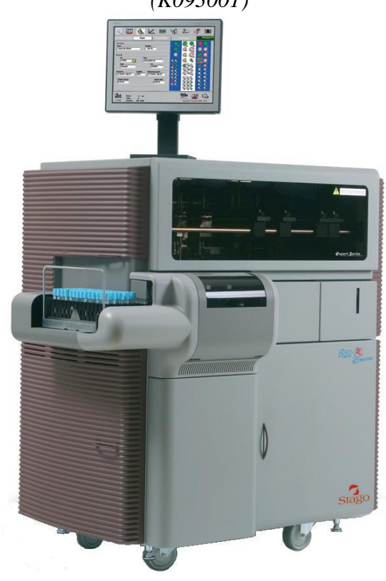
<u>Picture 2:</u> STA-R Evolution<sup>®</sup> Expert Series (K093001)