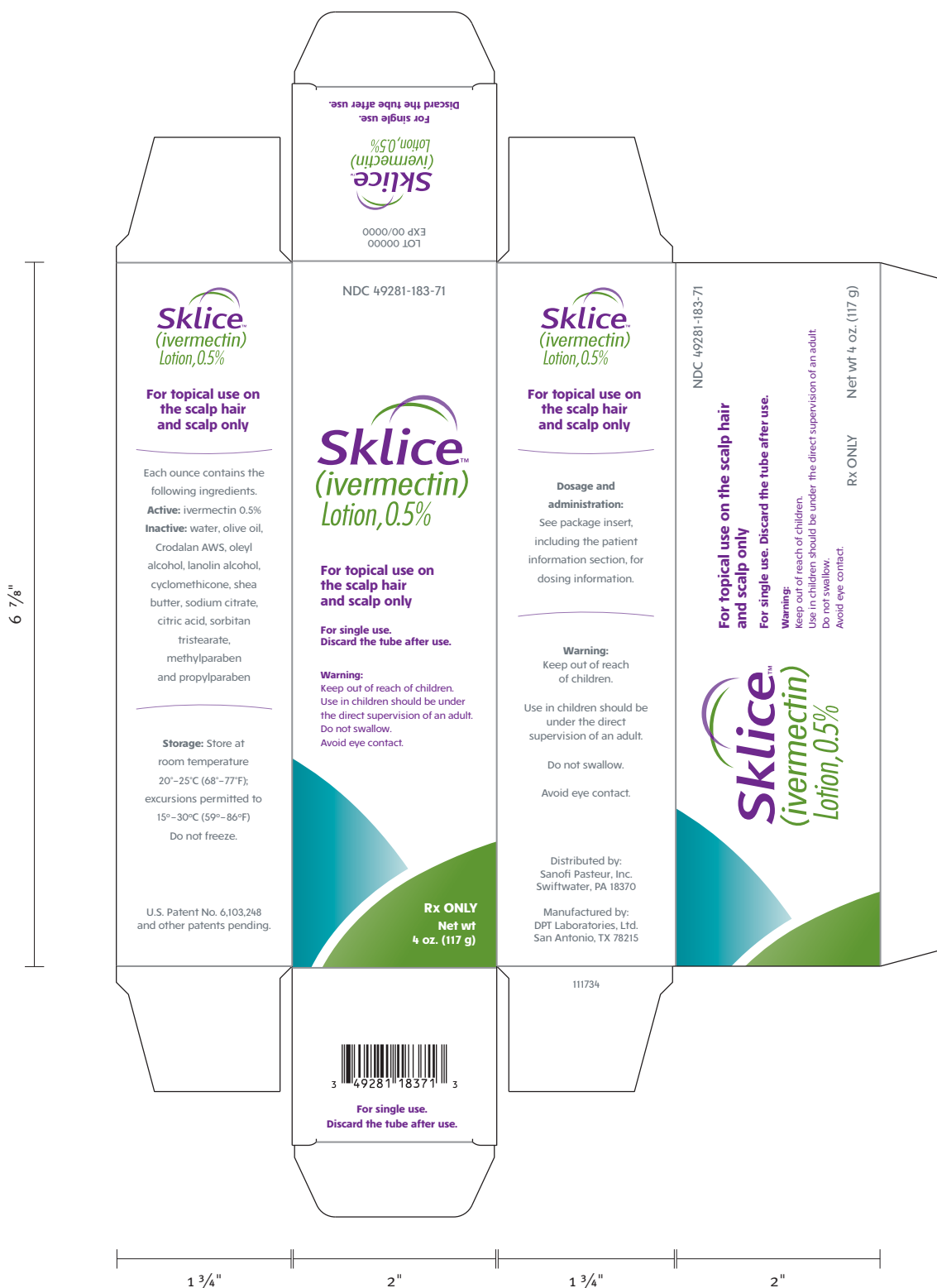
Sklice Tube Carton