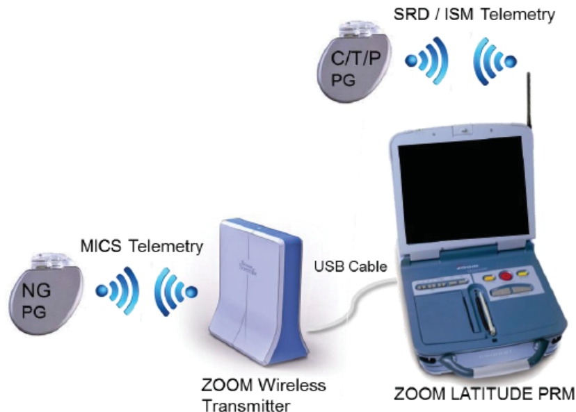
Figure 1-1: System Illustration of RF Telemetry

BSC provided a presentation which provided an overview of the submission.