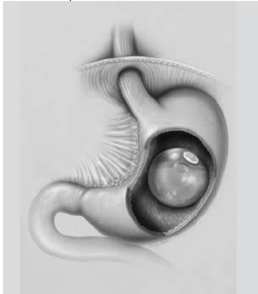
Figure 2. Saline-filled ORBERA™ in the stomach

ORBERA™ is placed in the stomach and filled with saline, causing it to expand into a spherical shape (Figure 2). The filled balloon is designed to occupy space and move freely within the stomach. The expandable design of ORBERA™ permits a fill volume range of 400cc (minimum) to a maximum of 700cc (refer to section 11.2 for filling guidelines). Once filled, the ORBERA™ volume is not adjustable. A self-sealing valve permits detachment from external catheters (see Section 10 Instructions for Use).