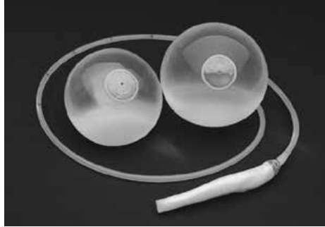
Figure 1. ORBERA™ filled to 400 cc and 700 cc with unfilled system in the foreground

ORBERA™ (Figure 1) is designed to assist weight loss by partially filling the stomach.