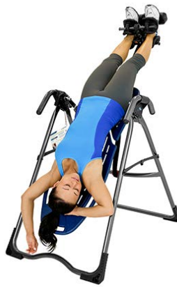
Manual Inversion Table

Manual Inversion Table – Supporting the user at the ankles, the device enables the user to rotate into the inverted position and allows the user to maintain a relaxed state as their body weight combined with the downward force of gravity creates progressive traction, decompressing each joint by the same weight that compresses it while upright. The user is able to predetermine or stop at their chosen degree of rotation, allowing increasing stretching intensity as the angle of inversion advances.