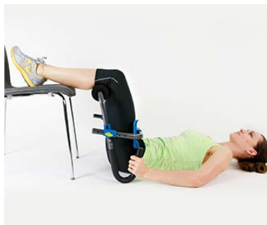
Portable Decompression Device

Portable Decompression Device – While seated on a flat surface, the user positions the device so the left and right thigh contacts align with upper-most thigh area and the foam roller contacts are behind the knees. The user reclines into the supine position, with knees and hips at 90°, flattening the lumbar curve to increase muscle relaxation and decompression of the lumbar spine once the device is utilized. The contacts provide leverage at the front and back of the thighs so that when the user pushes with their hands on the handles toward the feet, straightening their arms and applying self-controlled traction force to decompress the lumbar and mid-spine.