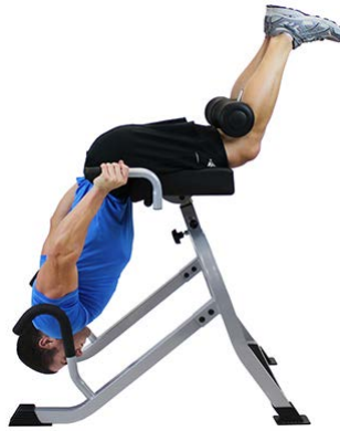
Forward Rotation Decompression Device

are flexed 90 degrees, placing the body in a position that flattens the lumbar curve, increasing muscle relaxation and decompression of the spine.