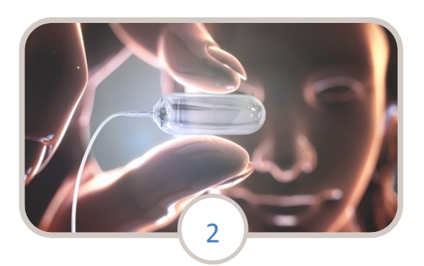
You will swallow a capsule