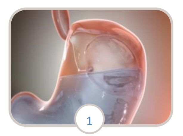
Once in the stomach, the Balloon is inflated with gas.