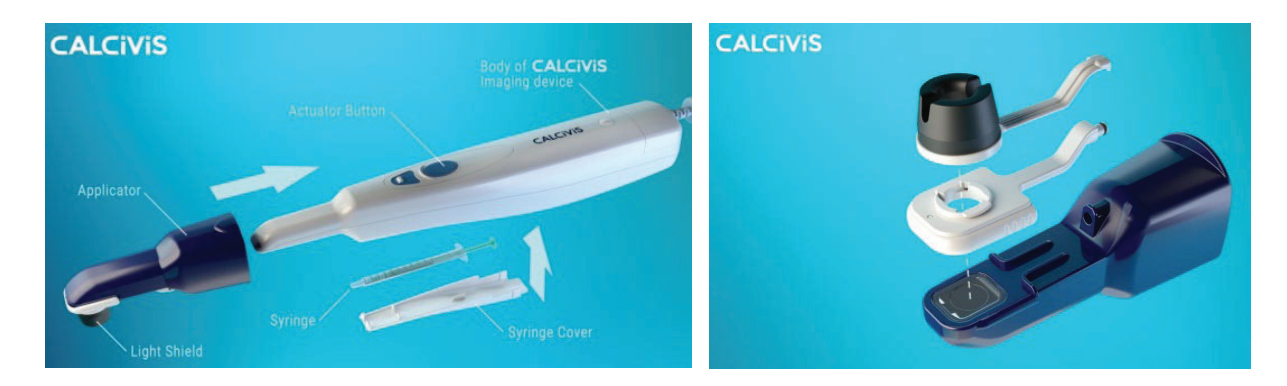
Figure 2. Identification and locations of parts for the CALCIVIS Intra-oral Imaging Device