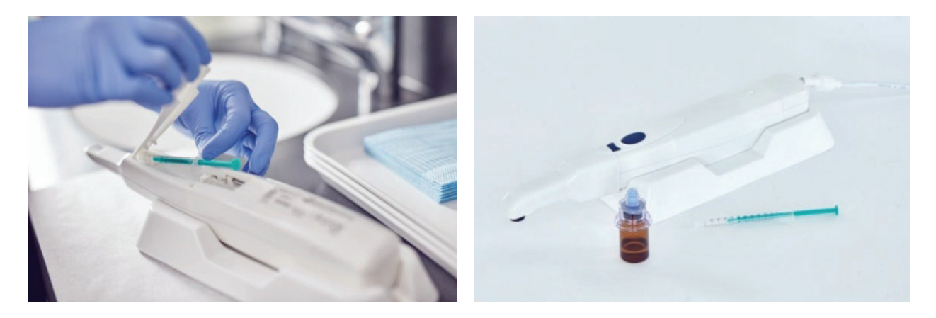
Figure 1. CALCIVIS Imaging Device loading and fully assembled CALCIVIS Imaging Device on stand

Overall, the CALCIVIS Imaging System is intended to provide images of active demineralization on tooth surfaces, as an aid to the assessment, diagnosis and treatment planning of demineralization associated with caries lesions. The CALCIVIS Imaging System is for use by trained dental healthcare professionals.