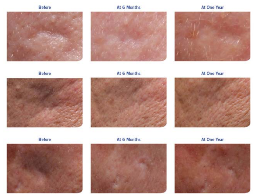
Figure 2: Photographs from Acne Scars-Clinical Study #3 showing results at 6 and 12 months after treatment.

Some close up examples of the results seen in this study are shown in the photographs below.