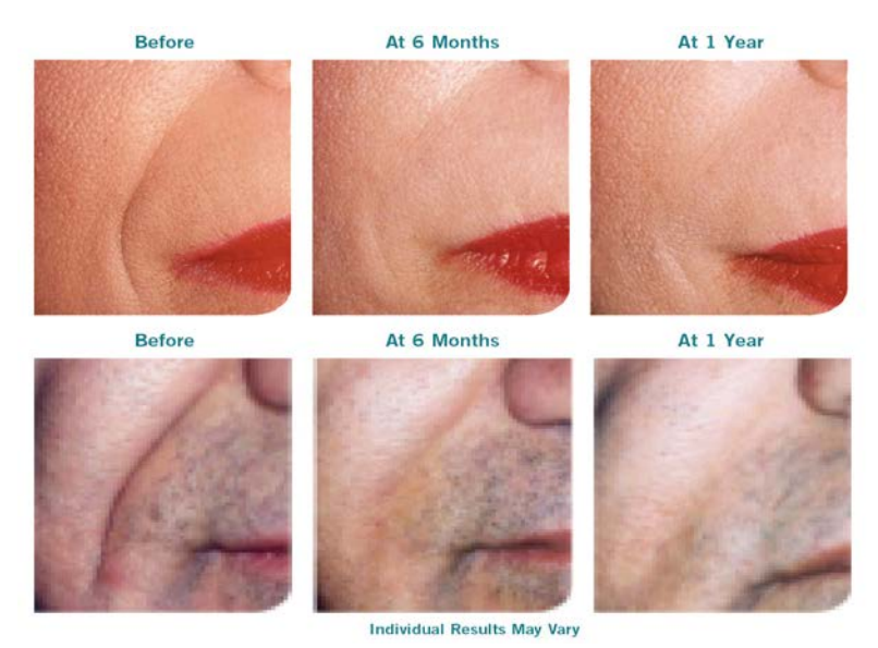
Figure 1: Photographs from Clinical Study # 2 showing results at 6 and 12 months after treatment.

One month after treatment, both Bellafill and the control collagen had a similar effect on improving the wrinkle. At the 3 month evaluation, Bellafill maintained its effect while the control collagen had a lesser effect. At the 6 month evaluation, Bellafill had maintained its effect while the Control group had lost its effect. This was the primary endpoint point at which effectiveness was determined. At the 12-month evaluation, Bellafill had maintained its effect. Safety was also evaluated up to 12 months after treatment. No evaluation was performed at 12 months after treatment for the Control group subjects.