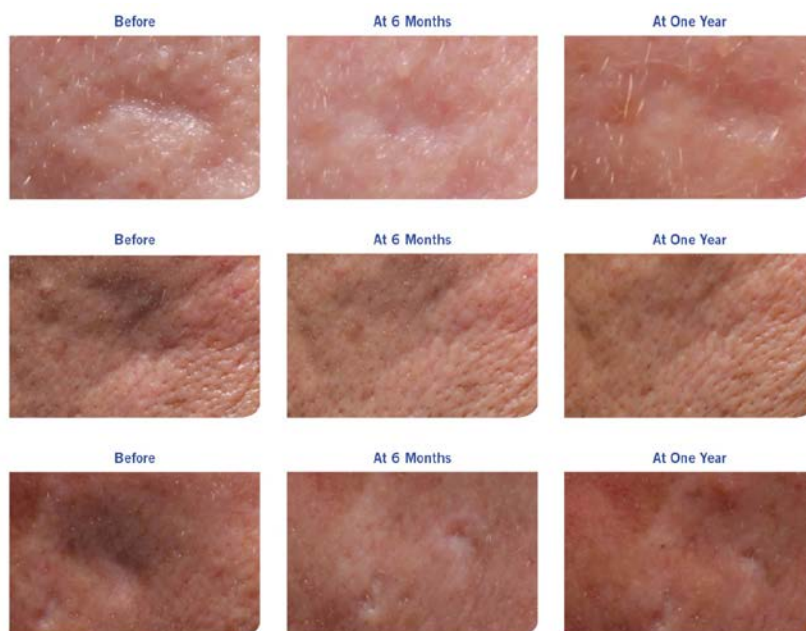
Figure 2: Photographs from Acne Scars Clinical Study #3 showing results at 6 and 12 months after treatment.

Some close up examples of the results seen in this study are shown in the photographs below.