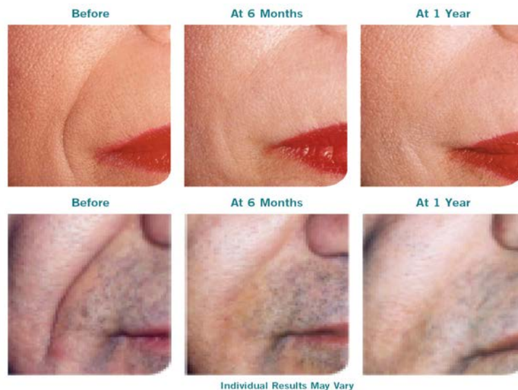
Figure 1: Photographs from Clinical Study # 2 showing results at 6 and 12 months after treatment.

One month after treatment, both Bellafill and the control collagen had a similar effect on improving the wrinkle. At the 3 month evaluation, Bellafill maintained its effect while the control collagen had a lesser effect. At the 6 month evaluation, Bellafill had maintained its effect while the Control group had lost its effect. This was the primary endpoint point at which effectiveness was determined. At the 12-month evaluation, Bellafill had maintained its effect. Safety was also evaluated up to 12 months after treatment. No evaluation was performed at 12 months after treatment for the Control group subjects.