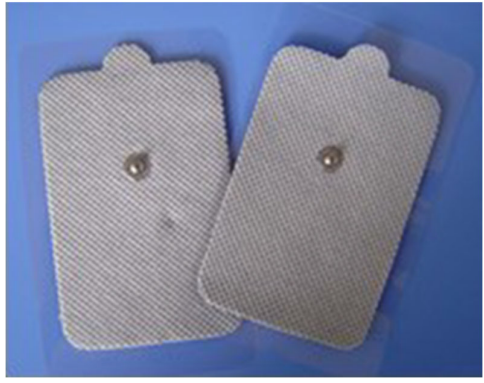
Fig 1. Entity diagram

key device components: The Starly pad consists of Insulation backing layer, Adhesive layer, Conducting film, Gel layer, Protective film and Snap fastener.