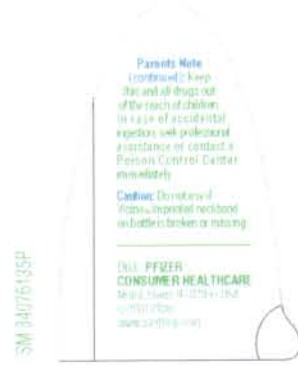
Open Position - Right