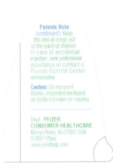
Open Position - Right