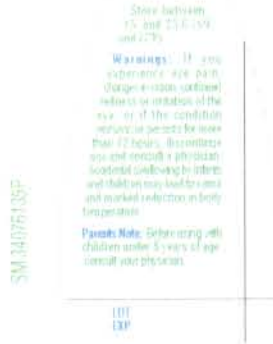
Open Position - Left