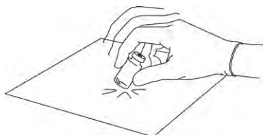
Figure 1: Tap firmly to mix.

Pad a hard surface to cushion impact (see Figure 1). Tap the vial firmly and repeatedly on the surface until no powder is visible.