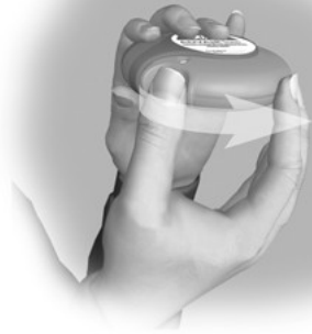
236 237 Figure 2

233 Hold the DISKUS in one hand and put the thumb of your other hand on the thumbgrip . Push 234 your thumb away from you as far as it will go until the mouthpiece appears and snaps into 235 position ( see Figure 2 ).