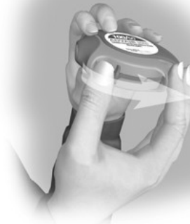
242 243 Figure 3

239 Hold the DISKUS in a level, flat position with the mouthpiece towards you. Slide the lever 240 away from you as far as it will go until it clicks ( see Figure 3 ). The DISKUS is now ready to 241 use.