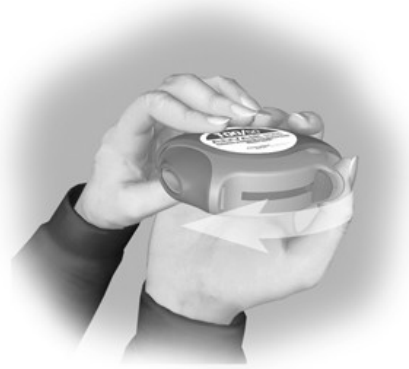
273 274 Figure 6

268 4. Close the DISKUS when you are finished taking a dose so that the DISKUS will be ready for 269 you to take your next dose. Put your thumb on the thumbgrip and slide the thumbgrip back 270 towards you as far as it will go ( see Figure 6 ). The DISKUS will click shut. The lever will 271 automatically return to its original position. The DISKUS is now ready for you to take your 272 next scheduled dose, due in about 12 hours. (Repeat steps 1 to 4.)