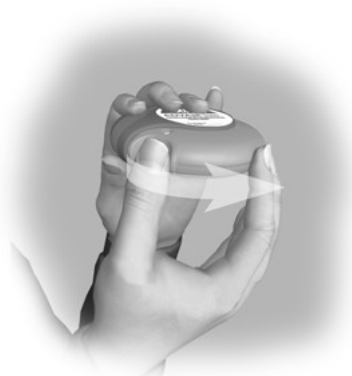
236 237 Figure 2

233 Hold the DISKUS in one hand and put the thumb of your other hand on the thumbgrip . Push 234 your thumb away from you as far as it will go until the mouthpiece appears and snaps into 235 position ( see Figure 2 ).