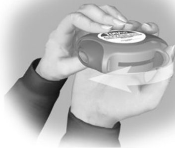
273 274 Figure 6

268 4. Close the DISKUS when you are finished taking a dose so that the DISKUS will be ready for 269 you to take your next dose. Put your thumb on the thumbgrip and slide the thumbgrip back 270 towards you as far as it will go ( see Figure 6 ). The DISKUS will click shut. The lever will 271 automatically return to its original position. The DISKUS is now ready for you to take your 272 next scheduled dose, due in about 12 hours. (Repeat steps 1 to 4.)