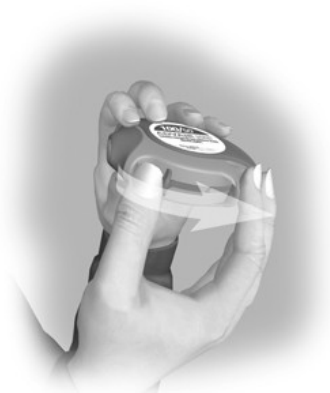
242 243 Figure 3

239 Hold the DISKUS in a level, flat position with the mouthpiece towards you. Slide the lever 240 away from you as far as it will go until it clicks ( see Figure 3 ). The DISKUS is now ready to 241 use.