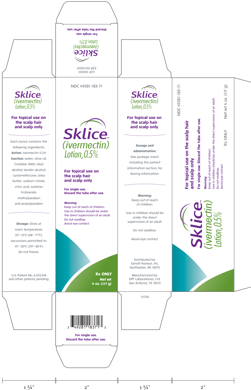
Sklice Tube Carton