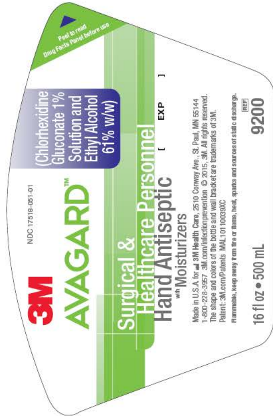
Front Cover Layer