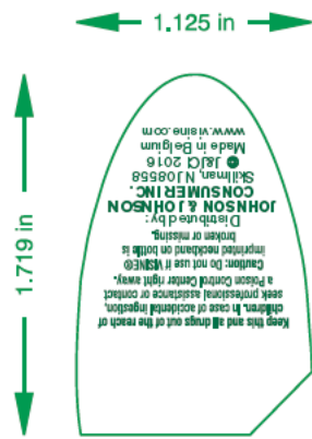
TOP PLY BACK (OPENED)