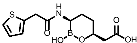
Figure 2: Structure of Vaborbactam

VABOMERE is supplied as a white to light yellow sterile powder for constitution that contains meropenem trihydrate, vaborbactam, and sodium carbonate. Each 50 mL glass vial contains 1 gram of meropenem (equivalent to 1.14 grams of meropenem trihydrate), 1 gram of vaborbactam, and 0.575 gram of sodium carbonate. The total sodium content of the mixture is approximately 0.25 grams (10.9 mEq)/vial.