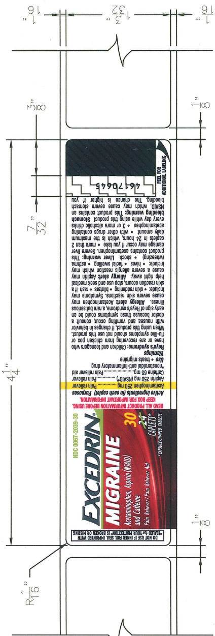
FRONT OF TOP PLY