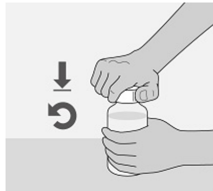
Figure A. Opening the bottle

Do not throw away the child-resistant cap.