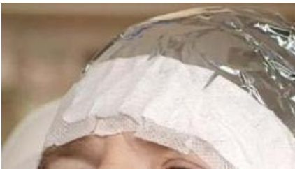
Figure 3: Occlusion

Cover the area where the gel has been applied with a light-blocking, occlusive dressing. Following 3 hours of occlusion, remove the dressing and wipe off any remaining gel.