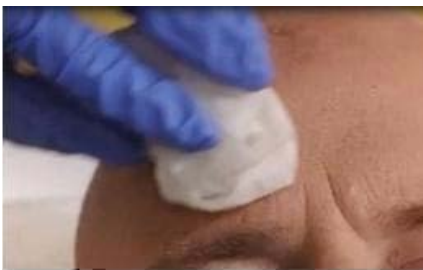
Figure 1A: Degreasing the skin

Before applying AMELUZ, carefully wipe all lesions with an ethanol or isopropanol-soaked cotton pad to ensure degreasing of the skin.