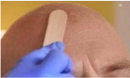
Figure 2: Drug application

Use glove protected fingertips or a spatula to apply AMELUZ. Apply gel approximately 1 mm thick and include approximately 5 mm of the surrounding skin. Use sufficient amount of gel to cover the single lesions or if multiple lesions, the entire area. Application area should not exceed 20 cm 2 and no more than 2 grams of AMELUZ (one tube) should be used at one time. The gel can be applied to healthy skin around the lesions. Avoid application near mucous membranes such as the eyes, nostrils, mouth, and ears (keep a distance of 1 cm from these areas). In case of accidental contact with these areas, thoroughly rinse with water. Allow the gel to dry for approximately 10 minutes before applying occlusive dressing.