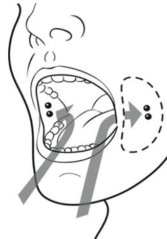
Figure A (2 tablets between your left cheek and gum and 2 tablets between your right cheek and gum).