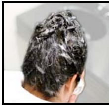
Correct application of TRADENAME Lotion

If not enough TRADENAME Lotion is used, some lice may escape treatment. It is important to use the full amount of TRADENAME Lotion prescribed by your doctor.