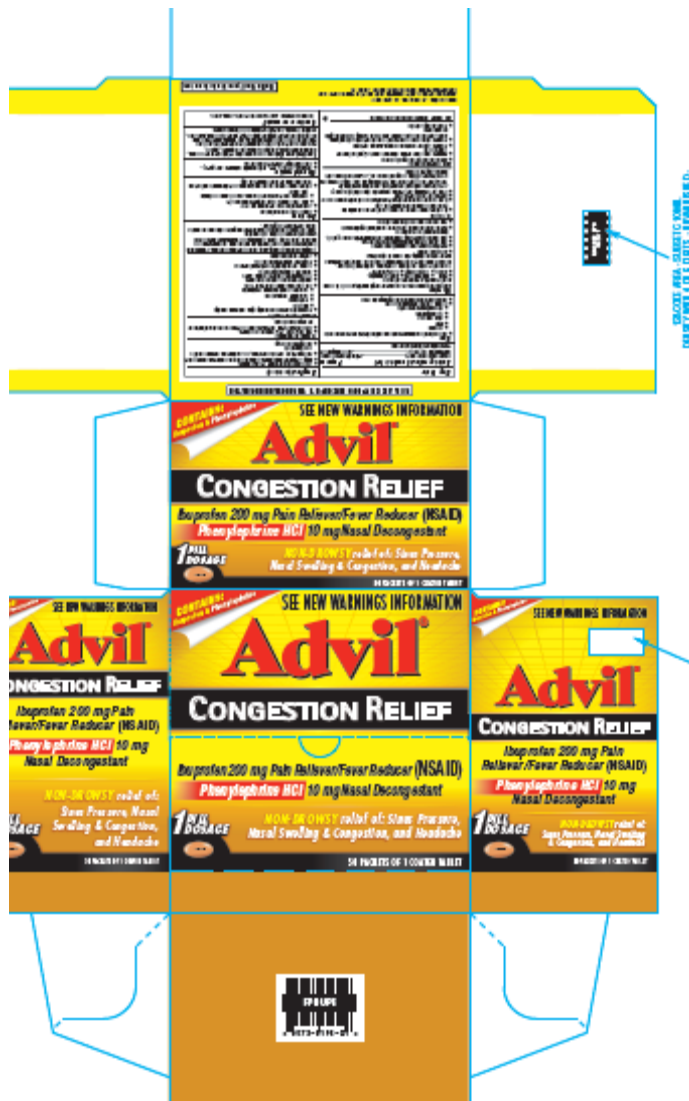
Shelf Carton Pouches