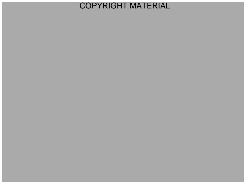
Figure 1: An Eadie-Hofstee plot for 3-hydroxypilocarpine formation from pilocarpine in human liver microsomes. Pooled human liver microsomes were incubated with 0.125 to 25 \mu\text{M} pilocarpine at 37°C for 60 min. Each data point represents the mean of duplicate determinations.

The formation of 3-hydroxypilocarpine in human liver microsomes was significantly inhibited (> 90%) by 200 \mu\text{M} coumarin. Other selective inhibitors of CYP1A2 (furofylline and \alpha -naphthoflavone), CYP2C9 (sulfaphenazole), CYP2C19 [(S)-mephenytoin], CYP2E1 (4-methylpyrazole), CYP2D6 (quinidine), and CYP3A4 (troleandomycin) had a weak inhibitory effect (< 20%) on the formation. The highest formation activity was expressed by recombinant CYP2A6. The K_m value for recombinant CYP2A6 was 3.1 \mu\text{M} , and this value is comparable with that of human liver microsomes (1.5 \mu\text{M} ). The pilocarpine 3-hydroxylation activity was correlated with coumarin 7-hydroxylation activity in 16 human liver microsomes ( r = 0.98 ). These data indicated that CYP2A6 is the main enzyme responsible for the 3-hydroxylation of pilocarpine.