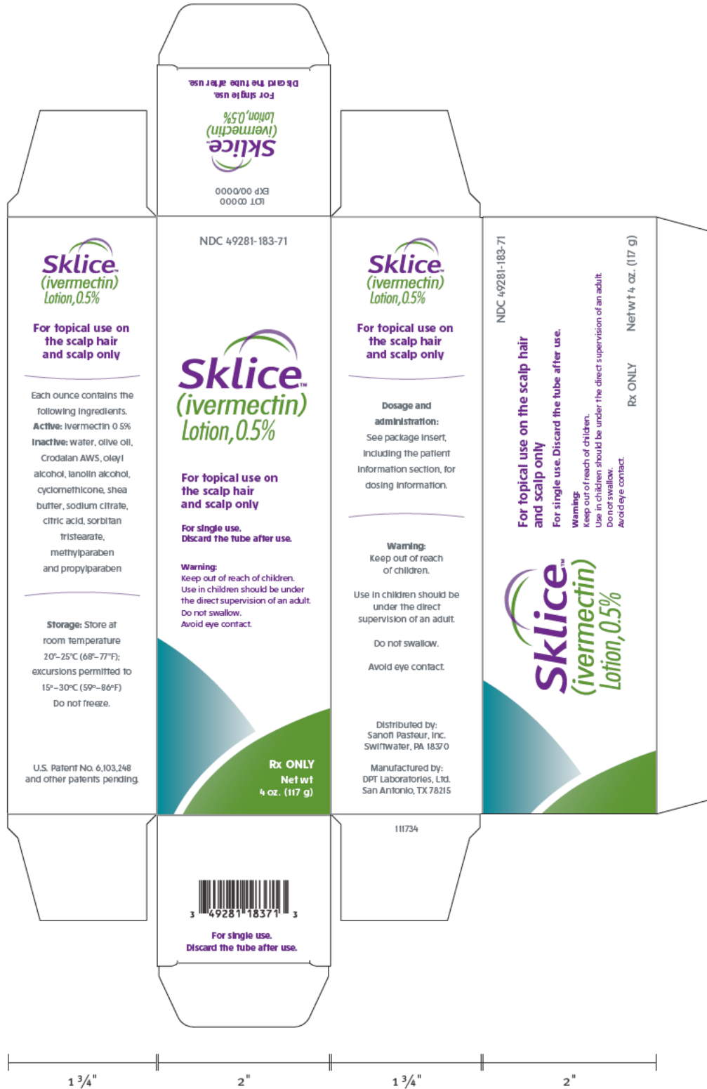
Sklice Tube Carton