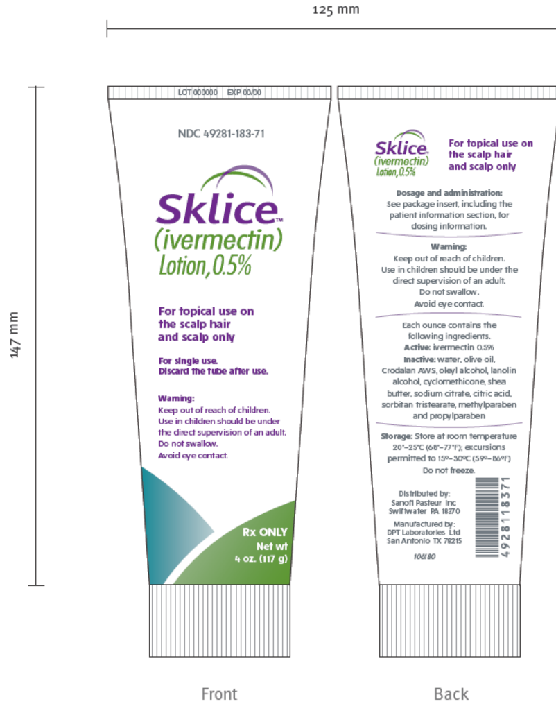
Sklice Tube Label