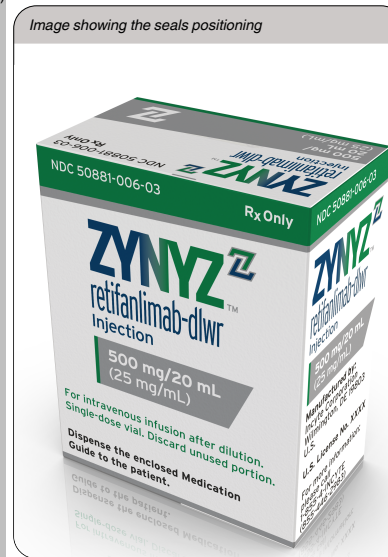
Image showing the seals positioning